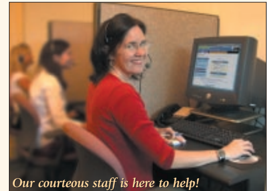
Our courteous staff is here to help!

Call Client Services at 866-570-0830. We'd be delighted to walk you through our online system. It only takes a few minutes.